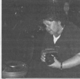
Many curious observers came out Aug. 13 to the Tourism and Trek Station to take in the Perseid meteor shower.

A short indoor presentation is followed by a snack and outdoor gazing,